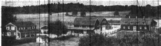
Only Thirteen Miles Away

Even the young couple "Going Modern" appreciates a Wedding Present that is not Stereotyped. You will find that the Antique Gift is the treasured one.