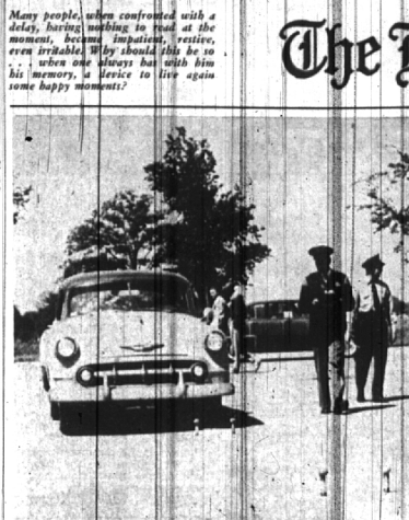
FOLLOWING THE WHITE LINE WAS TICKLISH Rubber balls went bouncing in this test