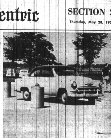
OBSTACLE COURSE IN FORWARD GEAR WAS EASY Backing around these barrels was the tough part