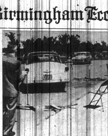
PARKING PROBLEM WAS A STICKLER FOR MANY Measurements were taken from curb to wheel