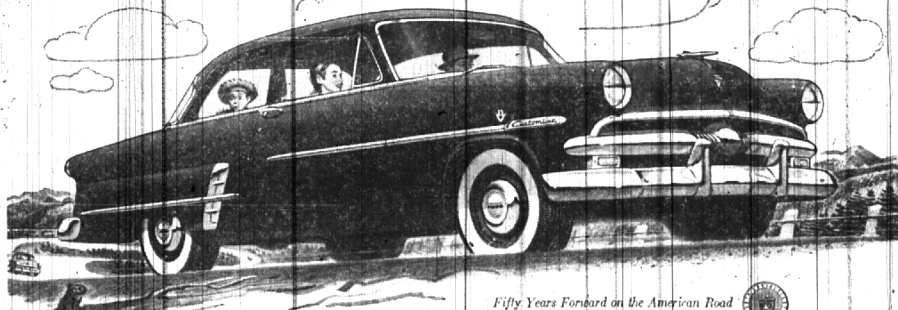
Fifty Years Forward on the American Road

You don't have to pay costly-car prices for costly-car comforts. Ford brings you everything [and we mean everything] you've ever wanted in a car, at a price that's well within your reach! And according to recent surveys, a Ford returns more of its original cost when sold than any other car at any price!