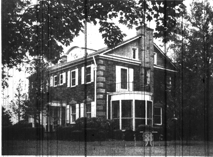
at 261 Clifton Road, Bloomfield Village

I'm looking for a large family. Nothing less than three or four children will make me happy! My spacious rooms were planned for fun and romping; and for "sleepy heads" I have six bedrooms and four baths under my roof. I'm in a nice, big, park-like setting of fine maple trees where it's safe for children to play, only a short bike ride to the best of grade schools. Three minutes walk for Mother's maid to the West Maple bus. For Dad, the taxes are low. Everyone says I'm a bargain at $37,500 including carpets in the living room, dining-room and hall. Drive by, look me over and then for an appointment call.