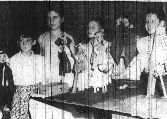
THE VACATION BIBLE school at the First Methodist church ended last week with a complete display of the work they have done during the two-week term.