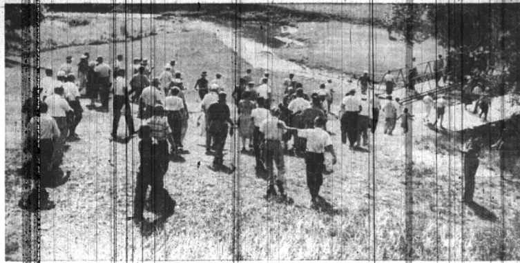
STEEP HILLS AND A BLAZING sun over the past weekend failed to discourage the thousands of golf addicts who flocked to Birmingham Country Club's clubhouse for the 35th annual Professional Officers' Association tournament. A portion of the crowd is shown here following the favorites down the hill of the first tee Friday afternoon as the "name" stars were being eliminated in par-breaking golf.

and filled picnic tables, competed were quick to praise township officials, civic organizations and the day-long program of activities. Members of the park commission park's development.