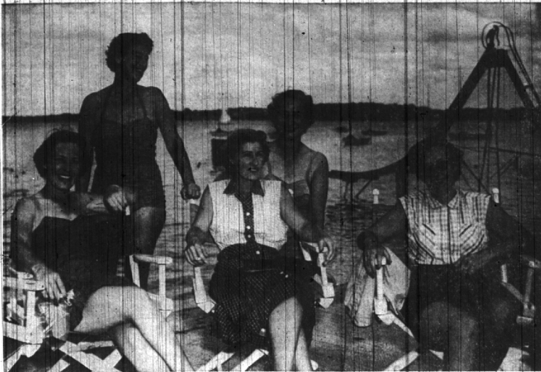
ENJOYING THE waterfront breezes at Orchard Lake Country Club on a recent summer afternoon were (from