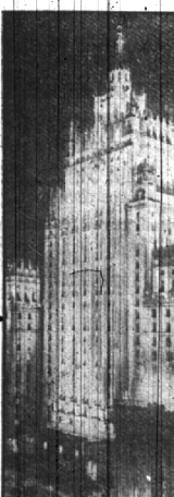
MOSCOW SKYSCRAPER —Seen above is the pride of the Russian capital, a towering skyscraper overlooking Smolensky Square. The building is short by American standards, being only a few floors over 25 stories.