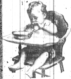
"Tiny Baby Type" attached to chair by short tapes

This is the "Tiny Baby Type" Eat-Neat High Chair Apron