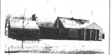
100 ft. site on boulevard

Here is a home that is not old, but has had substantial sums spent to improve it. The space is where you need it most.