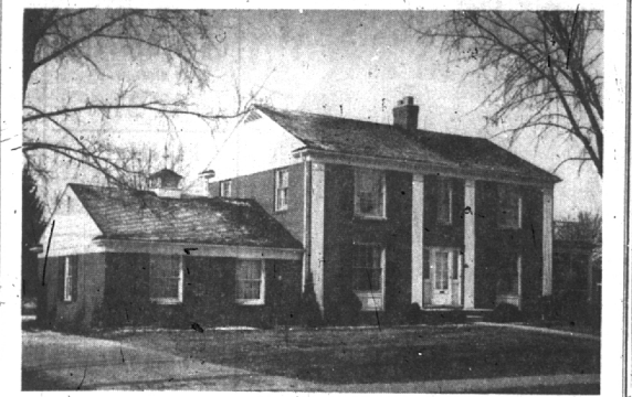
A marvelous two year old, center entrance Colonial on a beautifully landscaped 110 ft. site near Quarton School.