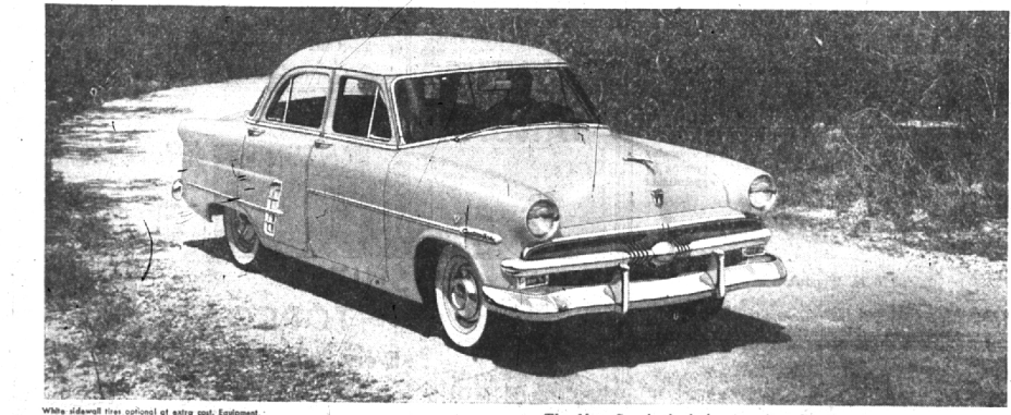
While shown this optional extra cost. Equipment, accessories and tires subject to change without notice.

If you've thought it takes gas-eating weight and hard-to-park length to give real riding comfort you ought to try this '53 Ford. For Ford's new Miracle Ride actually seems to be a carpet of smoothness even over the roughest roads. There's no bounce, pitch and sway to bother you, no uncomfortable roll on curves. Ford's new Miracle Ride marks a new era of riding comfort and quiet. It's another big reason why Ford is worth more when you buy it . . . worth more when you sell it!