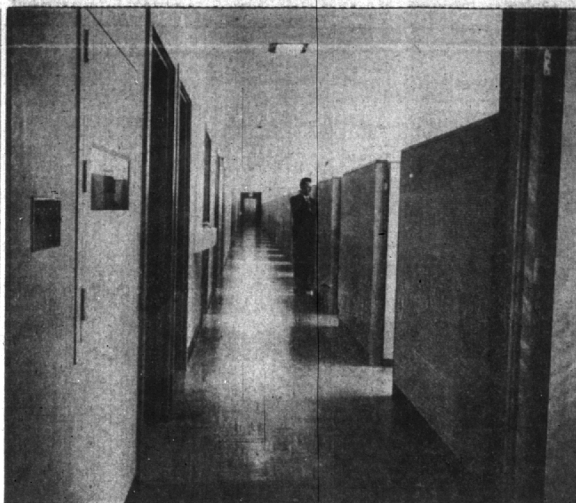
ONE OPERATIONAL FEATURE of the MacManus, John and Adams new office building at Woodward and West Long Lake road, Bloomfield Hills, is the centralized location for the advertising firm's account executives, copy writers and artists. Doorways on the left open into the offices of the various account executives with the account copy writers behind the partitions on the right. At the end of the long hallway are the account artists.