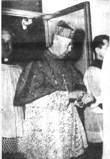
BIRMINGHAM'S newest Catholic church, Our Lady Queen of Martyrs, was blessed May 28 in a ceremony presided over by His Eminence Edward Cardinal Mooney (arrow) of Detroit. At the right the Cardinal is seen leaving the church at the conclusion of the ceremony.