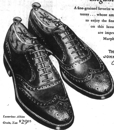
Luxurious Athlete Grain, Tan $29.95