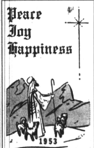
May THE STAR shine Bright for You