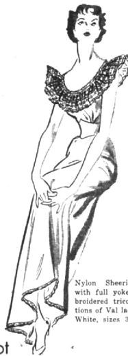
Nylon Sheerio gown with full yoke of embroidered tricot, insertions of Val lace. Blue, White, sizes 32 to 38. $10.95