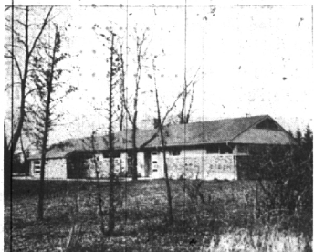
CRANBROOK NEAR 13 MILE

Build only last year . . . just time enough to get all the details finished! Contemporary lines . . . sleek and clean . . . it's immaculate.