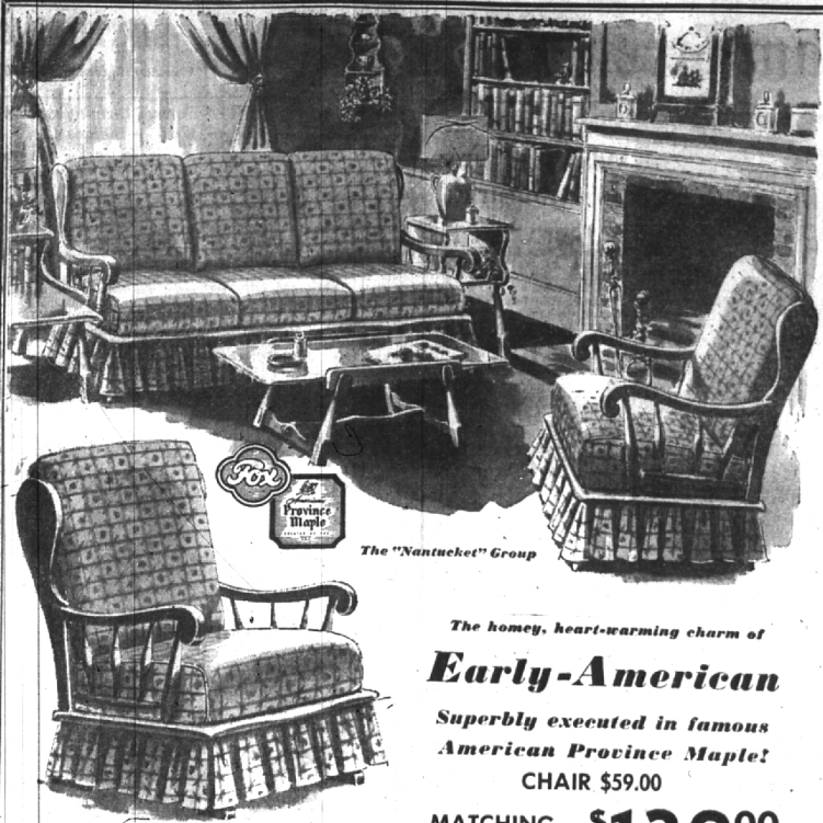
The "Nantucket" Group

The honey, heart-warming charm of Early-American Superbly executed in famous American Province Maple! CHAIR $59.00 MATCHING SOFA BED $139.00