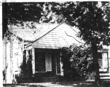
1876 Bates Street

THREE AND ONE-HALF BEDROOMS NOT ONE BUT TWO BATHS UNUSUALLY LARGE YEAR-ROUND PORCH IN KNOTTY PINE