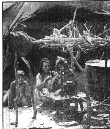
TEMPORARY TENT-LIFE —Jewish refugees in the Israeli tent-city of Zarnaga suffer through a period of primitive tent-living while waiting for construction of government housing projects. The United States Technical Cooperation Administration works with their government to help these refugees whose numbers have increased since recent anti-semitic acts behind the Iron Curtain.