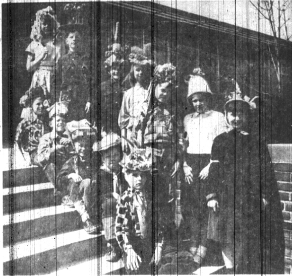
BEFORE LEAVING SCHOOL for the Easter vacation, members of the fourth and fifth grades at Vaughan School had an Easter parade and a hat contest at the same time. Pictured above are the school winners from each room and one could find everything from raw cabbage to a dust mop in the array of comical hats.