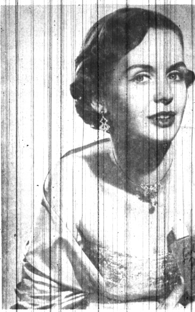
Lanolin Plus Liquid replenishes natural skin oils with softening, lubricating substances. Try it today; treat your face to a facial pick-up!

Don't let them. You can actually help remove, or greatly reduce premature wrinkles in a very simple manner. First what causes this kind of wrinkles? Nothing more than dry skin. To prove it, crush a piece of silk... then shake it out. It has no wrinkles. Now, crush a piece of note paper. It's permanently wrinkled... because it's hard and dry. Ordinary cleansing creams probably are the cause of dry skin. Although they cleanse, they remove the skin's surface lubricants—esters and cholesterol, and leave the pores clogged with mineral oils and waxes. These are closely related to lanolin, and not only fail to penetrate, but actually may further dry out the skin. All you have to do is soften the skin and premature wrinkles begin to give way. All you have to use is LANOLIN PLUS LIQUID . Use it as a cleanser; this tissue it off-