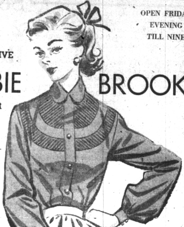
AS SEEN IN CHARM

...ever clever for young women of all ages