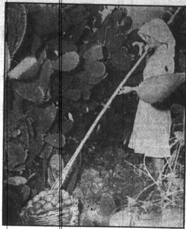
STICKY PROBLEM —Using a long-pronged pole to pluck prickly pears from their thorny plants, a Sardinian peasant girl of Cagliari harvests one of the crops that grow in overabundance on that primitive island. The fruit, used as a table serving on the mainland, is according to restriction, used only as livestock feed by the islanders.