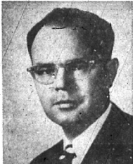
CHARLES E. POTTER for U. S. Senator