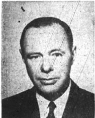
FREDERICK M. ALGER for Governor

Let's win the crusade at the polls November 4! Vote for the IKE TEAM! Vote straight Republican —and let's sweep it clean!