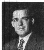
WILLIAM S. BROOMFIELD re-elect as Representative 4th Dist.