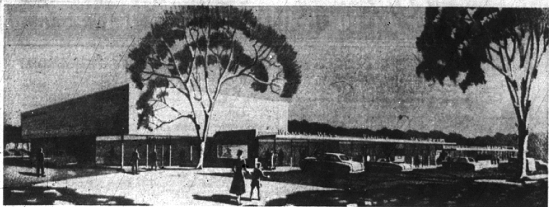
HERE IS HOW the proposed Barton shopping center will appear when completely finished on the north side of E. Maple, between Hunter and Pappleton. About 400 feet of frontage will be devoted to business establishments. The western third of the development will be two-story. Already under construc-

tion is the new Kroger supermarket at the east end. It is expected to be completed next spring. George Wolf of Detroit, handling the rentals, said as soon as details are settled, with other prospective tenants, the remainder of the project will be placed under construction.