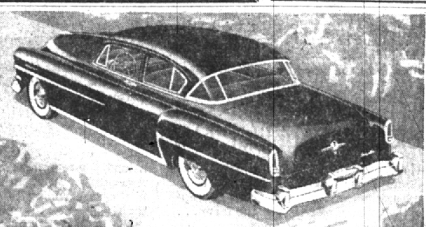
The beautiful new Chrysler Windsor Club Coupe