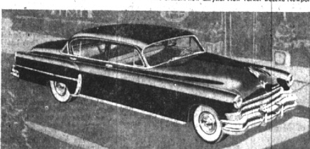
The majestic new Chrysler Custom Imperial 4-door Sedan