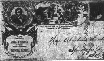
Personal possession of Abraham Lincoln