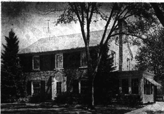
542 Pilgrim Road

This fine brick colonial offers wonderful, convenient, happy living for some lucky family. One block to the Detroit buses, 3 blocks to Quarton School and shopping center.