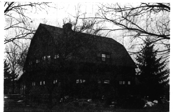
on picturesque Bingham Road

When a barn becomes a home it's news! And when it becomes as attractive and colorful as this distinctive country residence... it's welcome news for those who want the most in country living.