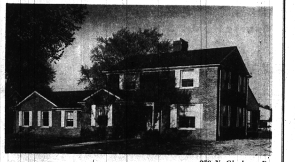
270 N. Glenhurst Dr.

JUST FINISHED, QUICK POSSESSION 3 bedrooms, 2 tiled baths plus first floor lavatory. First floor utility room plus full basement with an inviting recreation room. Screened porch, full storms and screens. The lawn is fully seeded and the shrubs have been planted since this picture.