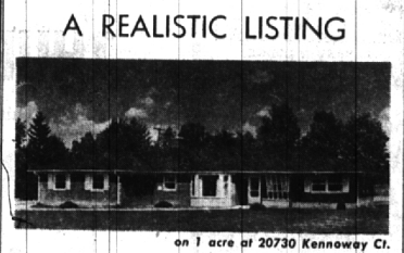
on 1 acre at 20730 Kennoway Ct.

GOODE-CHIERA CO. Realtors 750 So. Woodward, B'ham MI. 4-8200