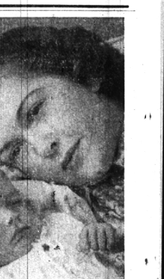
Serenity . . . hospital or medical bills won't cloud this picture!

For a Wonderful Reading Treat Get This Sunday's Issue of THE NEW AMERICAN WEEKLY EXCLUSIVELY with DETROIT SUNDAY TIMES