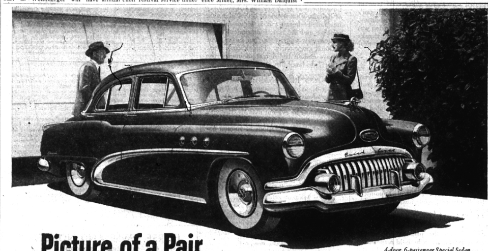
4-door, 6-passenger Special Sedan.