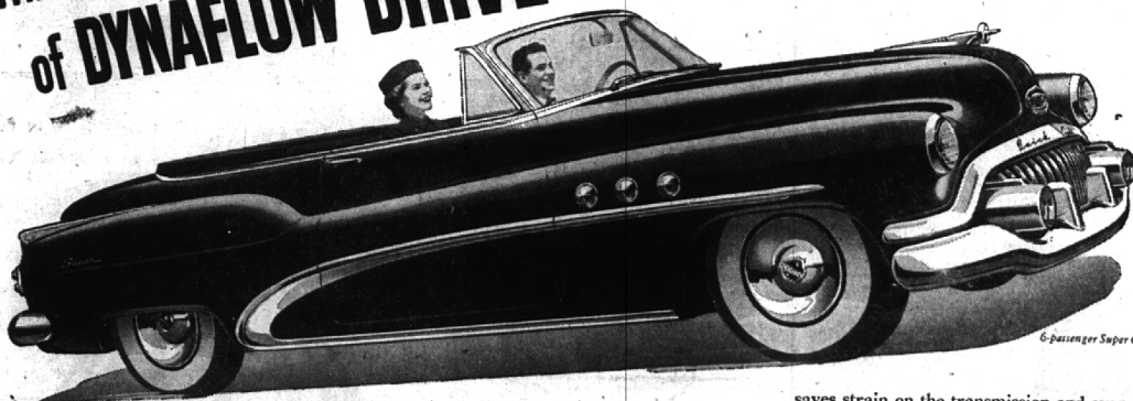
6-passenger Super Convertible.

THERE are all sorts of "drives" and "shifts" on the market.