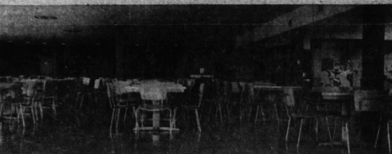
"BIRMINGHAM CHAIRS" and suspended walls combine to lend a smart restaurant look to the new Birmingham high school's cafeteria, affectionately called the Maple Room by the student body. Chairs and tables are stacked and the juke box turned on for school dances.

THE BINDERY would be moved to the basement where room is available. This room, she pointed out, is at the opposite end of the building from the present stairway and would prove a hardship for employees who would be called on to make many trips a day to the basement.