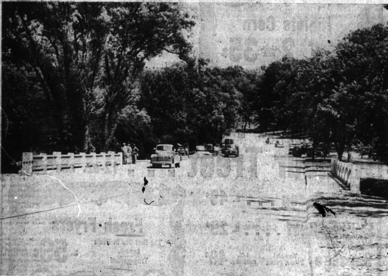
NICE, WIDE BRIDGE REPLACES FORMER 2-LANE HAZARD Here is what the motorist sees looking east and up the hill.