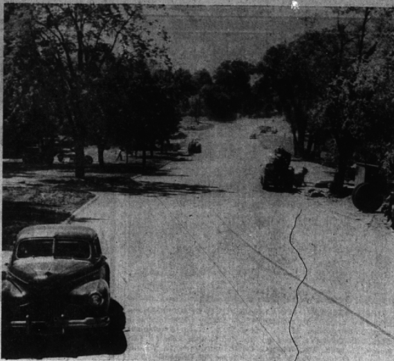
NEW, 4-LANE PAVEMENT, SMOOTHER CURVES PROVIDE GREATER SAFETY This is a view looking toward the west.