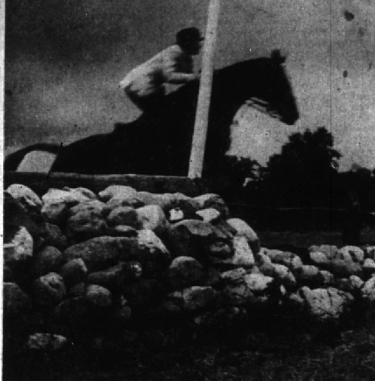
RIDER TAKES LAST HURDLE IN HUNTING CLASS Last weekend's show attracts thousands of spectators.

When the last jump had been taken Sunday evening, riders, owners and Open Hunt members gathered for a party at the club.