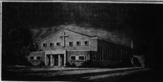
DRAWING OF OUR LADY QUEEN OF MARTYRS CHURCH BUILDING Will lay cornerstone Sunday afternoon for first unit

Birmingham will not play this coming Sunday, but will play Berkeley, Wednesday, July 9.