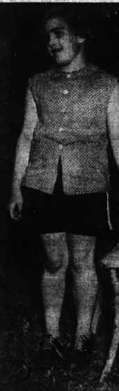
ANXIOUSLY WAITING FOR THEIR FIRST SALE last week were these four young residents of Oakland avenue.