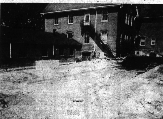
ALSO AT HILL school, this particular "hole in the ground" will eventually turn into a loading dock for trucks delivering school supplies. The program will call for the relocation of one door in the building which will give entry to a storage section for books and classroom materials for the several elementary schools in the Birmingham district.

★ Smile a Minute . . . he might have two balloons. "I'm sorry," was the reply, "but we only give one balloon to each boy. Have you a brother anxious to receive one of the playthings. As one small boy came up with, and I want one for him." —Coronet to the clerk, he asked politely if