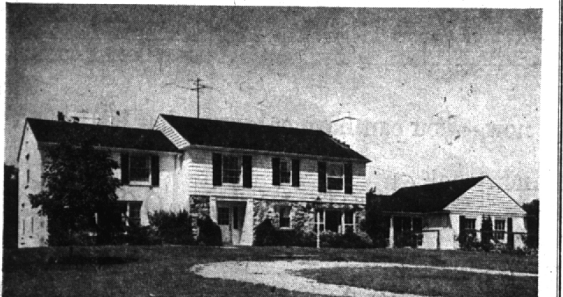
5211 Bayley Road

of a close-in Bloomfield Lake. This five acre site offers all the joys of country living; yet the conveniences of the City are only a few minutes away.