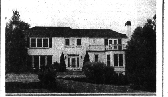
... A STRIKING HILL-SIDE CONTEMPORARY

Grace and beauty in a plan that's simple perfection . . . an enchanting contemporary home which is . . . WITHOUT RESERVATION . . . one of the finest residences in the entire area.