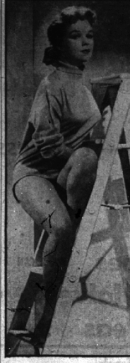
PERFECTION. ALMOST—Hollywood actress Sally Forrest ranks as "The Almost Perfect Girl" of 1951 as far as a poll of the Artist's Institute of America is concerned. Twenty-one year old Sally noosed out 2000 other rivals for the honor.

General news deadline is 4:30 p.m. each Tuesday.