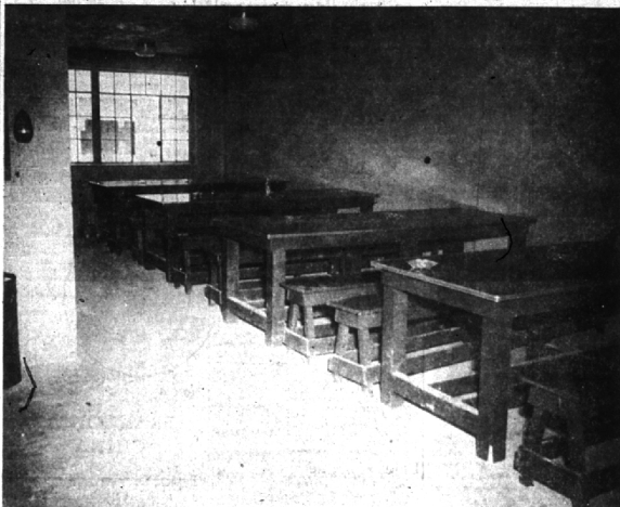
VOTERS WILL TEST THE DPW employees' dining room for the first time in the August 5 primary elections. Benches will be cleared for the voting machines but residents may find the new move will call for a supreme use of space.