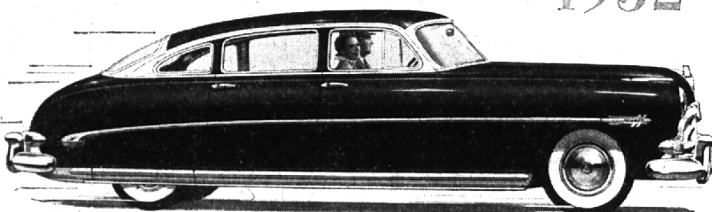
1952 HUDSON HORNET Four-Door Sedan in Hudson-Aire Hardtop Styling