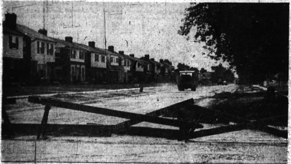
THE LARGEST STREET repair and paving program in the city's history was launched this summer. The above photograph shows workmen putting finishing touches on the South Bates project this August. Barricades in all parts of town were a common sight to local residents.