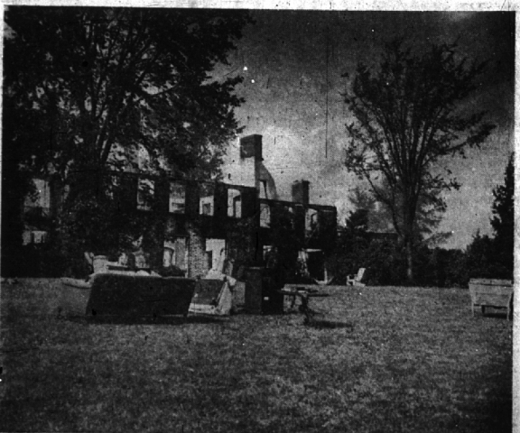
ONLY THE OUTER WALLS REMAIN of the Mrs. Francis Palms home on Eastways road, near Square Lake, Bloomfield township as a result of a windup fire late in September. Damage was estimated at $350,000 to the 25-room, three story mansion. Seven trucks from four fire departments were at the scene.