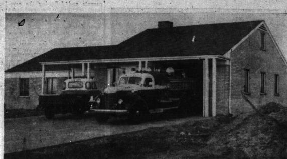
SOUTHFIELD TOWNSHIP'S NEW 13 MILE ROAD FIRE HALL One of two new stations in township