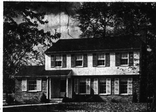
909 Fairfax Road

and superb condition make this house an unusually desirable offering. From the tiled basement floor to the second floor ceiling, this house just shines. The interior decorative scheme is most attractive.