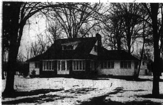
Vaughan School, too!

You can forget your far-away lake cottage . . . forget camp and vacation expense . . . you can live here in this comfortable one-floor home and the lake is at your door!