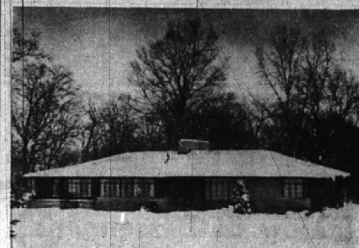
On eight acres of land

Do you want a home where the beauty of the stream and rolling hills are in keeping with your dream house? . . . this is perhaps one of the finest offerings we have had the pleasure to present. The old phrase "you have to see it to appreciate it" really applies here.