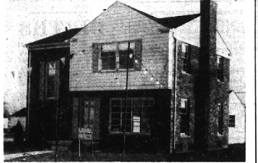
17825 Kirkshire — In Beautiful Golfhurst 1 Block E. of Southfield—1 Block S. of 14 Mile Road (OPEN 10 a.m. to 9 p.m. DAILY)

You get a "lift" when you walk through the door of this pleasant home. Located on a corner lot, this Brick Colonial has a front-to-back 23-foot living room with picture windows at each end, and a natural fireplace. There's an around-the-corner dining room; a sunny and cheerful step-saver kitchen; and many other outstanding features. A staircase with tall window leads up to three lovely bedrooms and tiled bath. Novel floor plan permits easy access to any part of the house from front or grade doors. But come and see for yourself—the quality workmanship and materials Miller put into this home. You'll like everything about this convenient and well located home in Golfhurst—a controlled community.