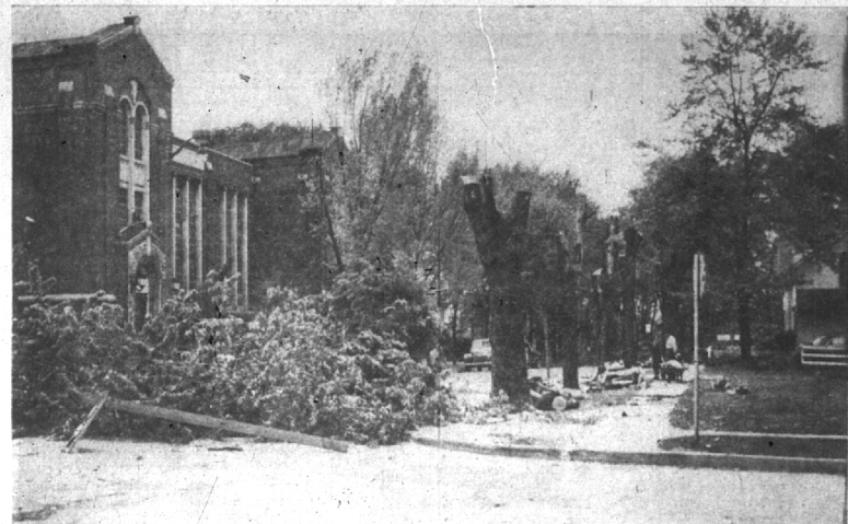
TREES COME down along West Maple as work gets started on the street widening program. Baldwin school, for the first time in years, stands without the friendly

covering of the branches. Although some residents protested loudly, the tree removals were required by the widening of the street in that particular block.