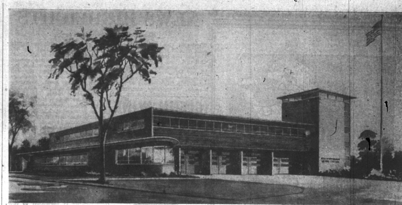
BIRMINGHAM VOTERS decided on April 7 not to construct this building on Adams road to house a second unit of the city's fire department. The architect's plans for the

Issue of March 13 School Supt. Dwight B. Ireland said this week that if Birmingham is to continue its present educational facilities, approval of the proposed $5.5 million city taxpayers will cast their vote at a special March 31 election to determine their opinion. Proposed special assessment districts for seven new paving projects were approved by Bham City