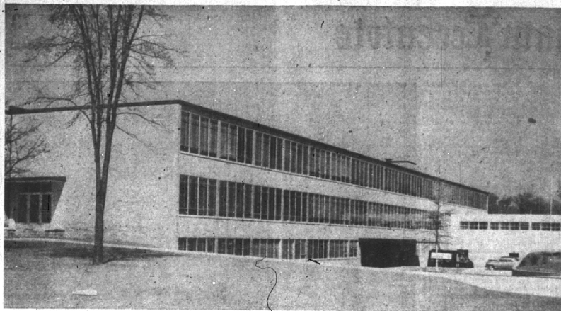
... TRI-LEVEL classroom section is designed for beauty, facility and comfort.