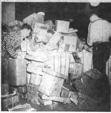
BIRMINGHAM POST OFFICE WORKERS hurry to keep abreast of the mountains of mail being received daily. These boys attempt to keep the main floor of the post office clear as . . .